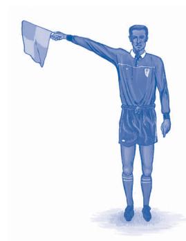
The throw is to the team attacking this way!